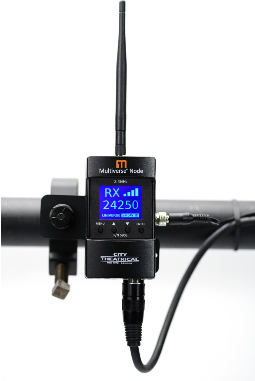
Figure 3: Pipe Mount