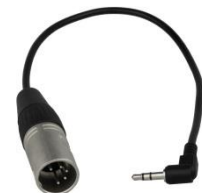
DMX Adapter ART7-ADP