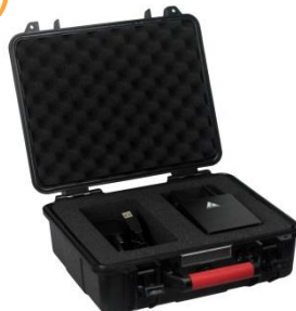
Carrying Case ART7-CSE