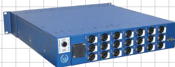
GBS 2U 28-Port