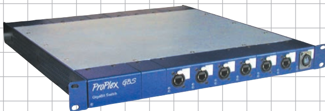
GBS 1U 10-Port